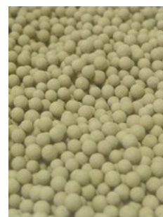
Molecular Sieve Dessicant